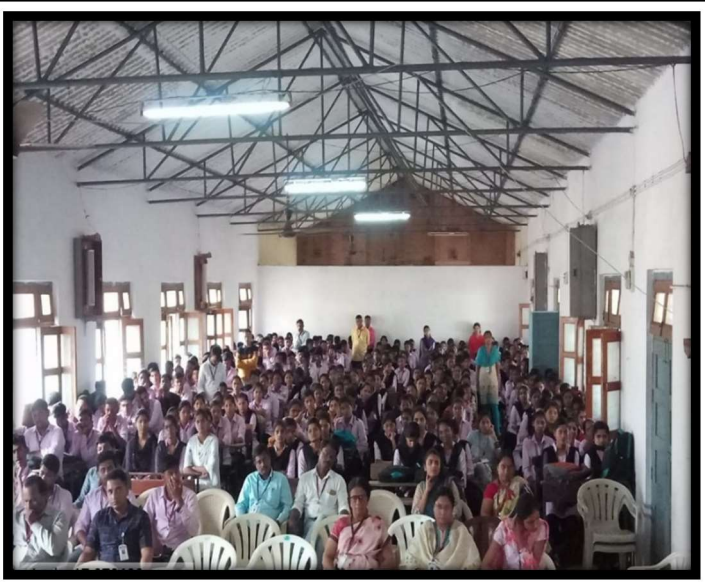
Students and faculty was participated in the workshop