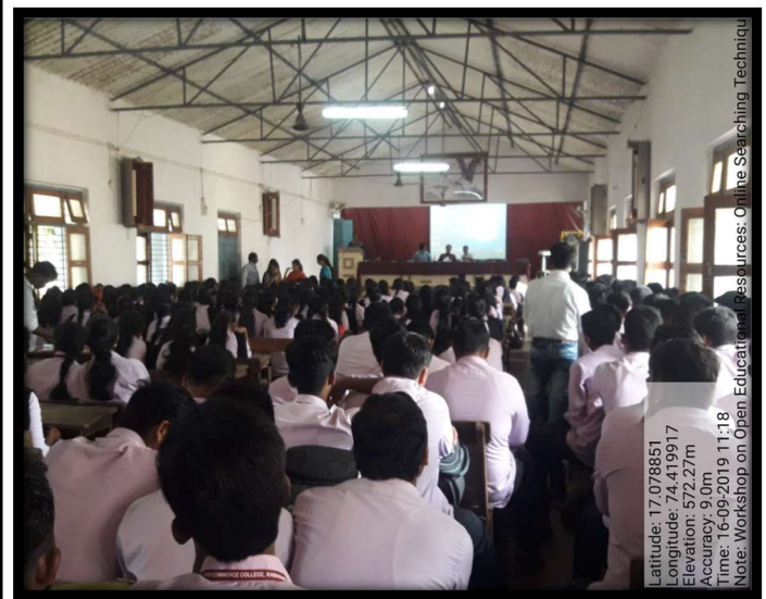
Students of the college involving on one day workshop